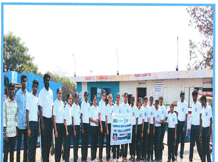
Caption: Choose Life, Not Tobacco. Say No to Smoking!